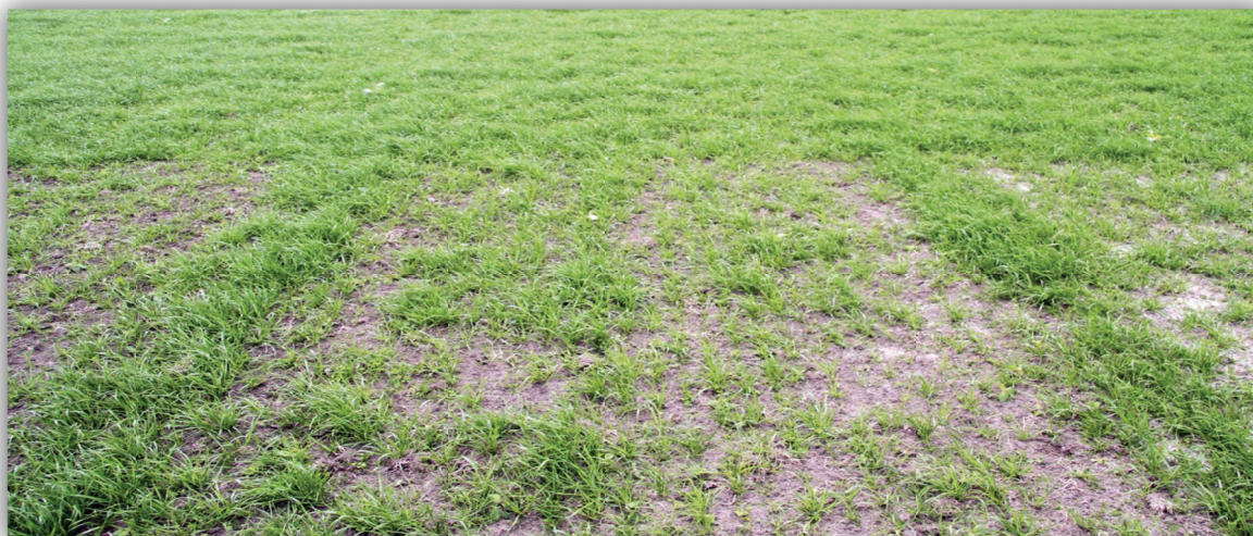
Poor, uneven establishment.

Control flatweeds with herbicide(s) in the first 6 weeks after sowing, regardless of ryegrass sowing rate.