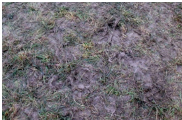
Figure 1: Mild (above) and significant (below) treading damage to pastures due to cow grazing during 'wet' periods.