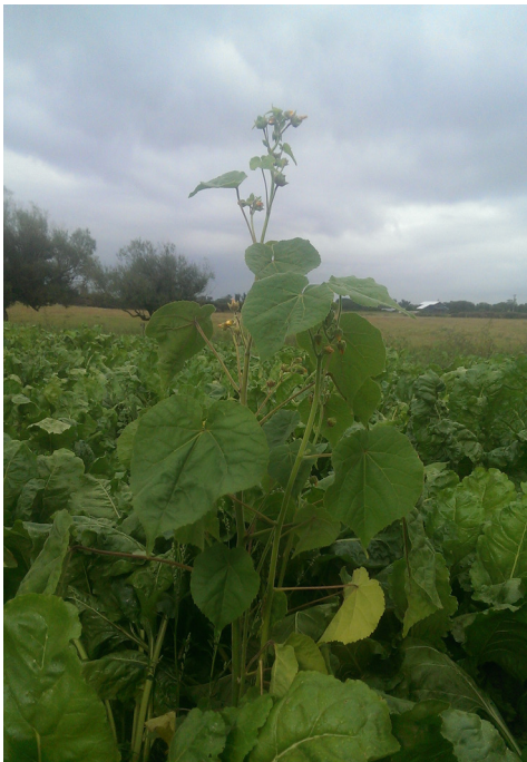
Velvetleaf mature plant