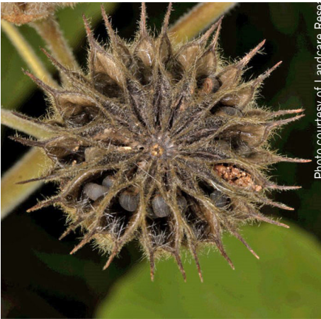
The velvetleaf seedpod