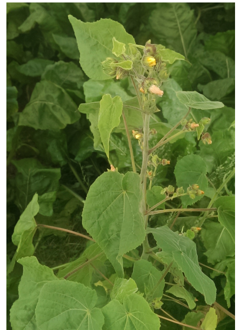
Velvetleaf mature plant