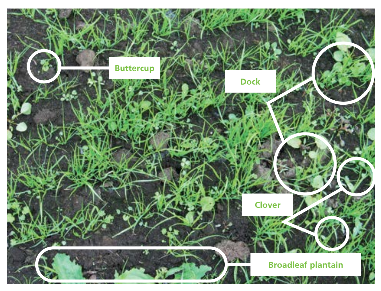
Figure 3: Weed seedlings establishing in a new pasture.

Also circled (centre and lower right) are clover seedlings with trifoliate leaves, indicating they are less susceptible to damage from the preferred herbicides ( Phenoxy butyric ).