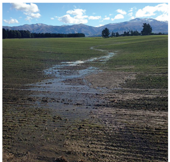
Figure 1. Examples of critical source areas

Critical source areas are those parts of the landscape, such as swales and gullies, where overland flow and seepage converges to form small channels of running water, which may then flow to streams and rivers. (Figure 1).