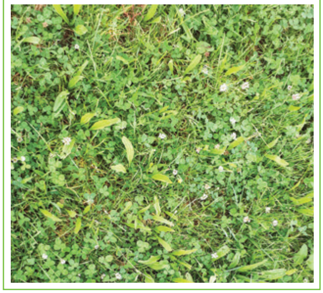
Figure 1: one-year-old perennial ryegrass/plantain/clover mix near Dannevirke. The pasture was sprayed, drilled and rolled in March 2017. The seed sown comprised 22 kg perennial ryegrass + 3 kg plantain + 2 kg sub clover + 2 kg white clover.

has a minimal benefit for herbage production<sup>10</sup>. Plantain in a ryegrass pasture mix is necessarily managed as with a ryegrasswhite clover pasture (grazing to residuals of 1500-1600 kg DM/ ha), which is within the tolerance of plantain<sup>9,10</sup>.