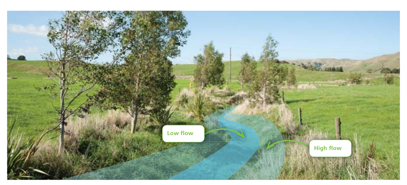
Set fences back from the regular high flow height. This may be quite different from the low flow height.

Your local Horizons Freshwater Management Officer can answer questions you have about fencing and riparian margins during a farm visit. They can then develop riparian plans with you, tailored to your farm. Call 0508 800 800 and ask for your local Freshwater Management Officer. It's the best way to find out what funding or support is available.